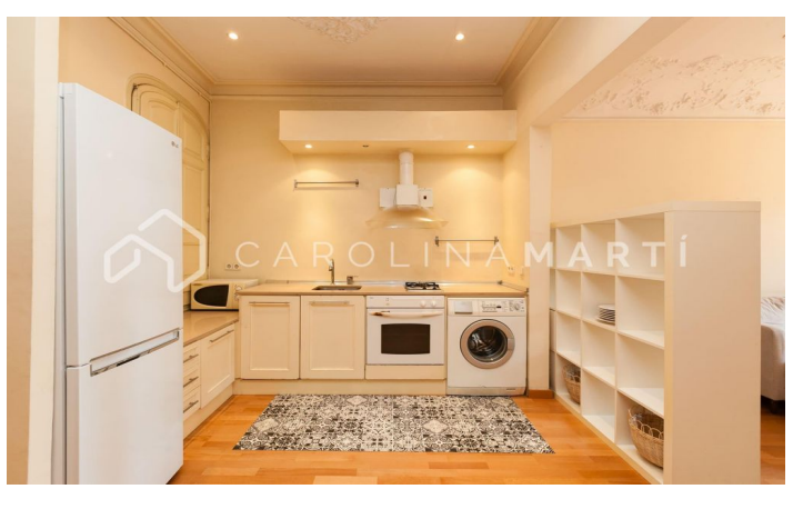
Contact us for more information or to arrange a viewing

Tel: +34 93 241 10 95 <a href="mailto:info@carolinamarti.com">info@carolinamarti.com</a> <a href="mailto:www.carolinamarti.es">www.carolinamarti.es</a>