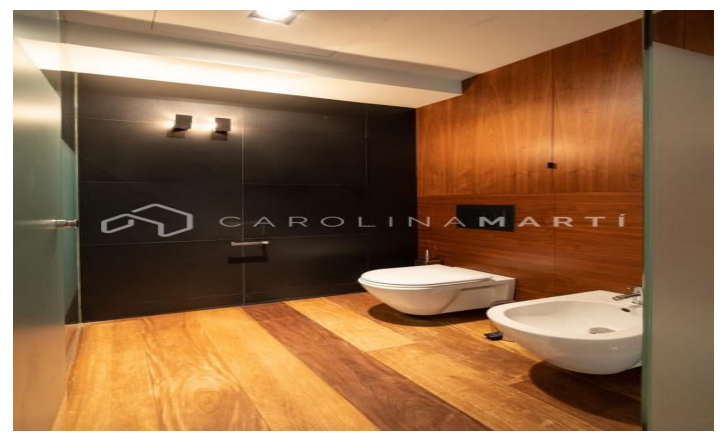
Contact us for more information or to arrange a viewing

Tel: +34 93 241 10 95 <a href="mailto:info@carolinamarti.com">info@carolinamarti.com</a> <a href="mailto:www.carolinamarti.es">www.carolinamarti.es</a>