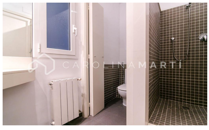
Contact us for more information or to arrange a viewing

Tel: +34 93 241 10 95 <a href="mailto:info@carolinamarti.com">info@carolinamarti.com</a> <a href="mailto:www.carolinamarti.es">www.carolinamarti.es</a>