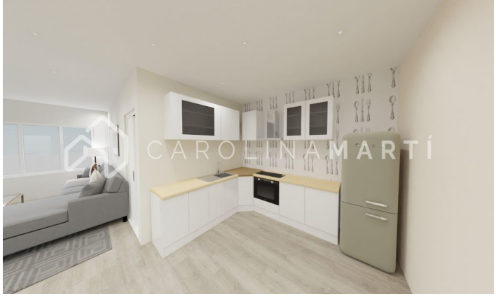
Contact us for more information or to arrange a viewing

Tel: +34 93 241 10 95 <a href="mailto:info@carolinamarti.com">info@carolinamarti.com</a> <a href="mailto:www.carolinamarti.es">www.carolinamarti.es</a>